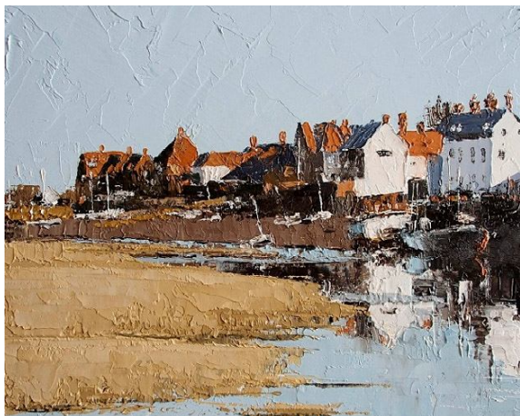
Wells next the Sea - Barry Holt

Here are some examples of some of our members work.